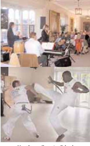
New Jersey Capoeira School

Yet again in May 2004 Task Brasil Inc. held the Brazilian reunion with the circle of families who have all adopted children from Brazil. This year the event was held in the Katz Civic Center in NJ, USA. Brazilian music and a Capoeira performance from New Jersey Capoeira School, Newark, New Jersey added to the fun whilst the Task Brasil stand was kept busy selling the new lines on T-shirts and pretty jewellery made by the girls from Task Brasil's Project Daiana. (see our website if you want to buy any of our products and support our work).