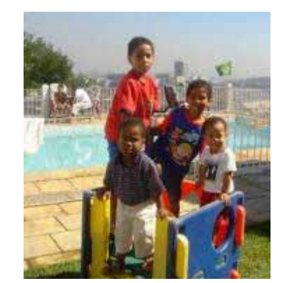
CHILDREN AT CASA JIMMY

Since 1998 more than 300 children and teenage girls with their babies have lived at Casa Jimmy, most of whom have been reintegrated with their families and, if not, adopted. Without Casa Jimmy many of them would not have been living in a safe home or had access to education and health care away from the streets.